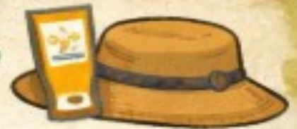
Sun Cream & Sun Hat (in hot weather)