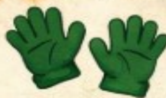
Gloves for Cold Days